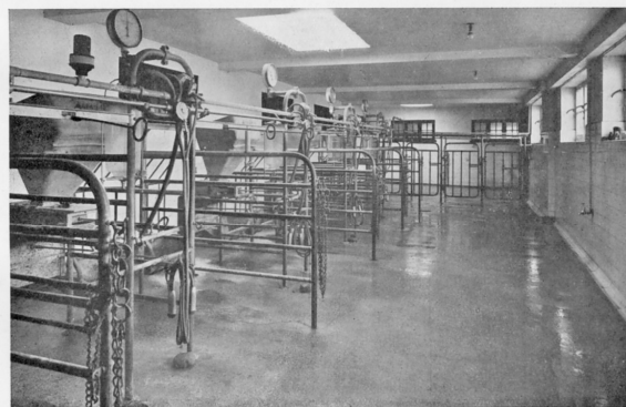
WARREN FARM MILKING PARLOUR