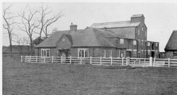
WARREN FARM ESTATE OFFICE AND BUILDINGS