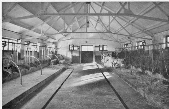
WARREN FARM COWHOUSE